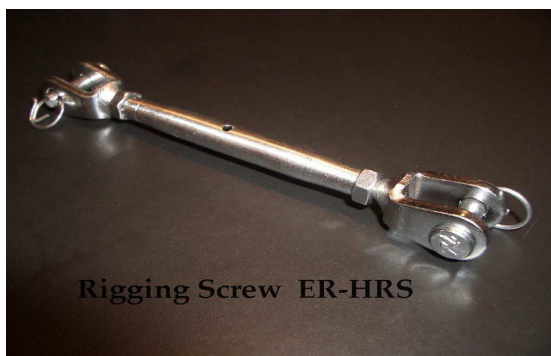
Rigging Screw ER-HRS